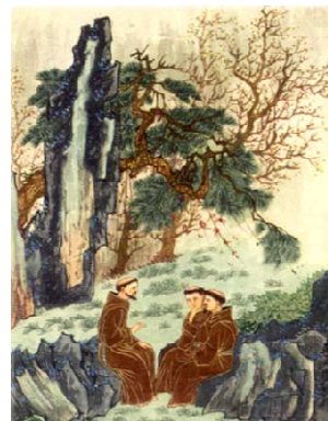
St. Francis talks to his Companions. Maybe near La Verna.