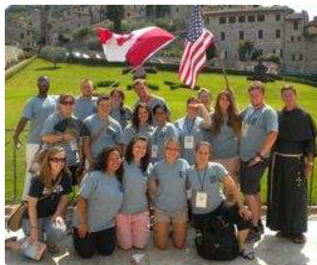
Last day in