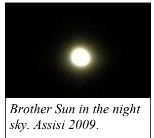
Brother Sun in the night sky. Assisi 2009.

Lately, I have been walking in the stillness of the night and have found it very comforting- for it is in the darkness that the light is most striking, most intense, most evident. I pray that as you celebrate LOVE with your families, Christ our Light be striking, intense and most evident in your homes.