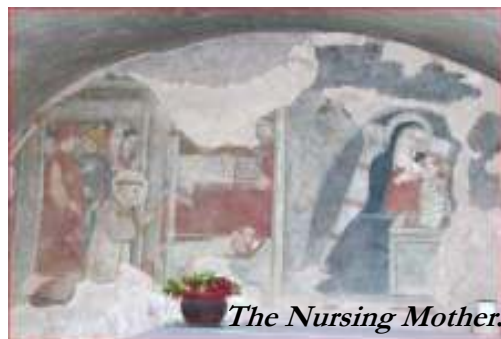
Photo taken in the Chapel of the Crèche, built the year of the canonization of Saint Francis of Assisi (1228), on the site where the commemoration of Christmas had taken place. In this cave was painted, in the 14 th century, Christmas in Greccio (left) beside the Nativity in Bethlehem fresco,

"Each one went home full of ineffable joy."