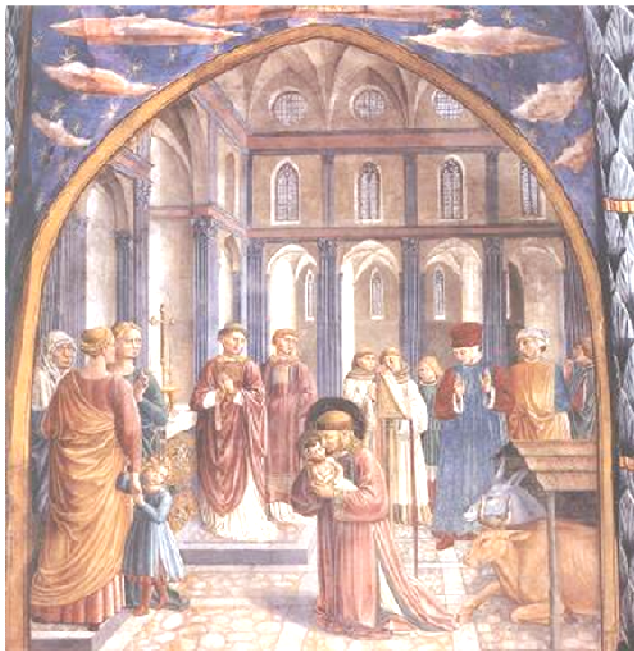
The Christmas of Francis of Assisi