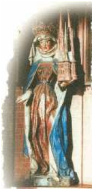
St. Elizabeth , Taken from the Church of St. Elizabeth in Marburg, Germany.

"We have come to believe in God's love: In the encyclical which forms the program for his pontificate, Deus caritas est (DC 1), Pope Benedict XVI has recalled to us that these words express the fundamental option of a Christian.