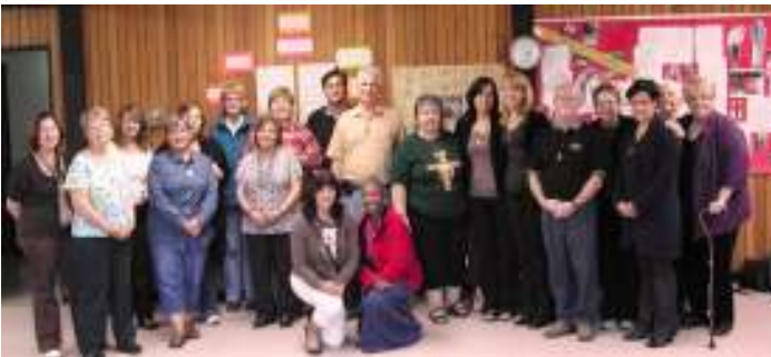
TRF RETREAT: MONO MILLS 2010 Some of the retreatants.