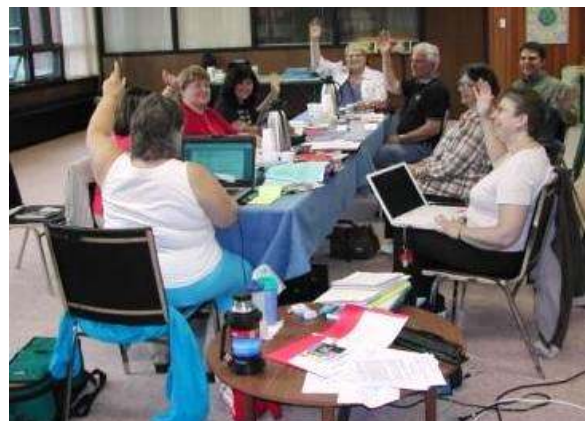
The TRF Council at work.